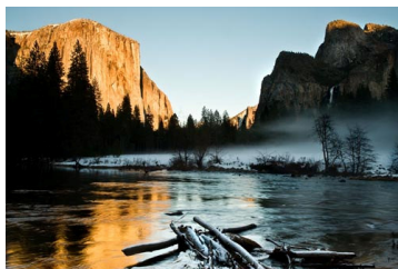
El Capitan in Yosemite.