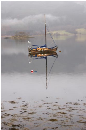
Image by GDPU club member taken during the 2009 SYHA Spring Weekend in Torridon.

“This magical island of ever changing light provides the keen photographer with ample opportunity to capture some of the islands special magic.”