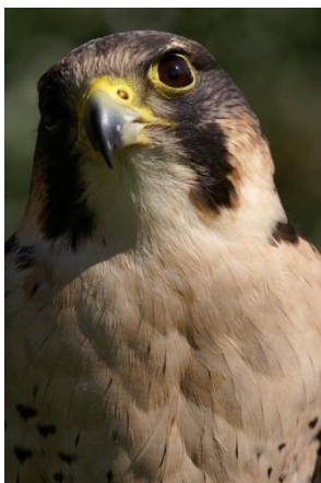
Image by GDPU club member taken during the Digital Workshop Day in New Lanark

“This magical island of ever changing light provides the keen photographer with ample opportunity to capture some of the islands special magic.”