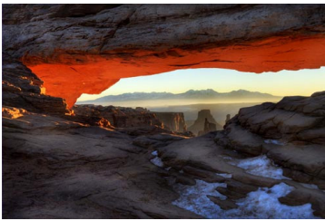
Mesa Arch, Utah.