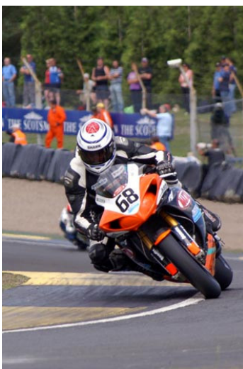
Title: Number 68 Author: Andrew Cameron

The entry forms and rules for the GDPU exhibitions can be found on the web site: www.GDPU.co.uk